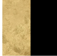
White/White - WHW

Digital: Not all screens are calibrated the same, and therefore, colors will appear differently between screens.